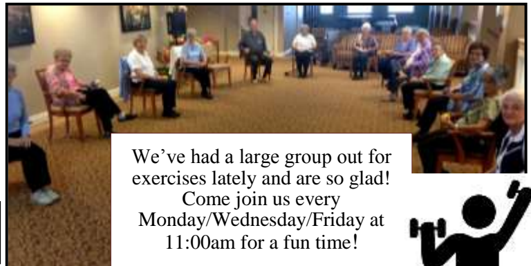
We've had a large group out for exercises lately and are so glad! Come join us every Monday/Wednesday/Friday at 11:00am for a fun time!