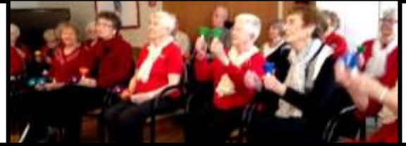
The Resident Christmas Supper and Party