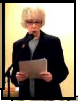
Our Christmas Party was such a joyous time of sharing, singing and laughs! What a fantastic and loving community we have! Merry Christmas everyone!