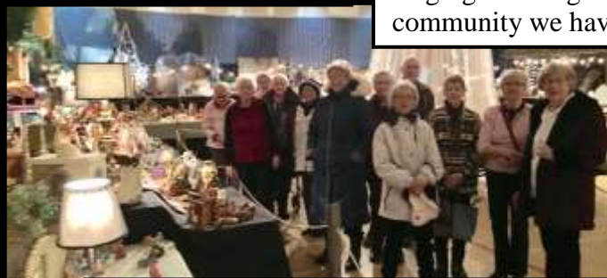
The displays were amazing at the Festival of the Nativities!!