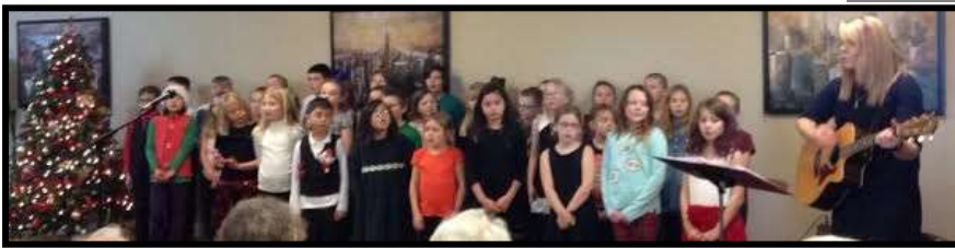
We were lucky to have been entertained by such a variety of children's groups this season!