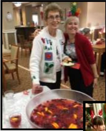
The Girl Guides who came were a cute treat to see during Christmas supper! →