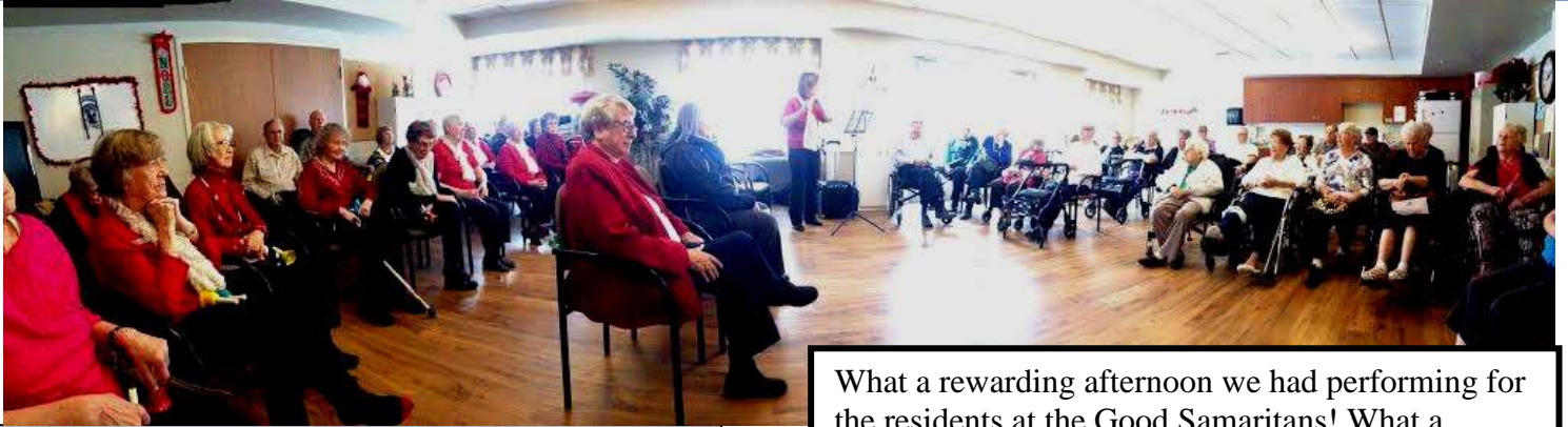
What a rewarding afternoon we had performing for the residents at the Good Samaritans! What a talented group we have too, from hand bells to our choir to line dancing! Good job to all of you!