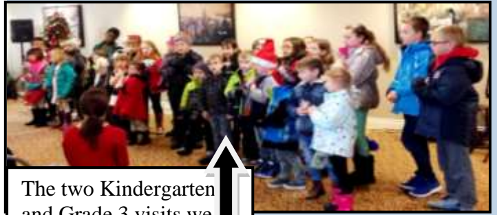
↑ The two Kindergarten and Grade 3 visits we had from Father Leonard Van Tighem School were adorable! What did you think of the Reindeer Pokie?