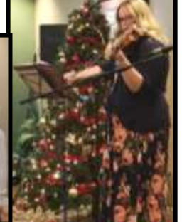
Thank you to you and your families for participating and making Family Fireside Night a success!